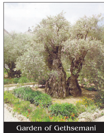
Garden of Gethsemani