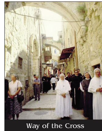
Way of the Cross